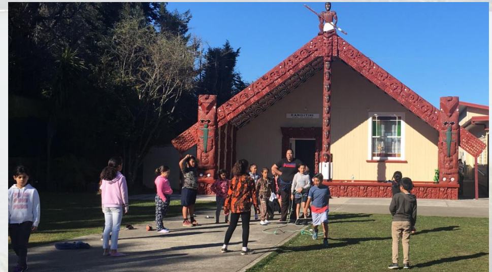
Rumaki tamariki having fun at Taheke Marae.